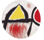
Gallery 3 Figure in front of the sun , 1968