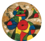
Gallery 11 Tapestry of the Fundació , 1979