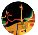
Gallery 4 Man and Woman in Front of a Pile of Excrement , 1935