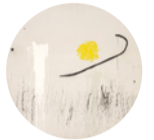
Gallery 3 The Hope of a Condemned Man , 1974