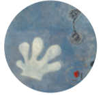
Gallery 2 Painting (The White Glove) , 1925