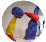
Gallery 12 Pair of Lovers Playing with Almond Blossoms , Model, 1975