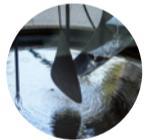
Gallery 11-12 (B) Mercury Fountain , Alexander Calder, 1937