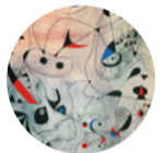
Gallery 4 Morning Star , 1940